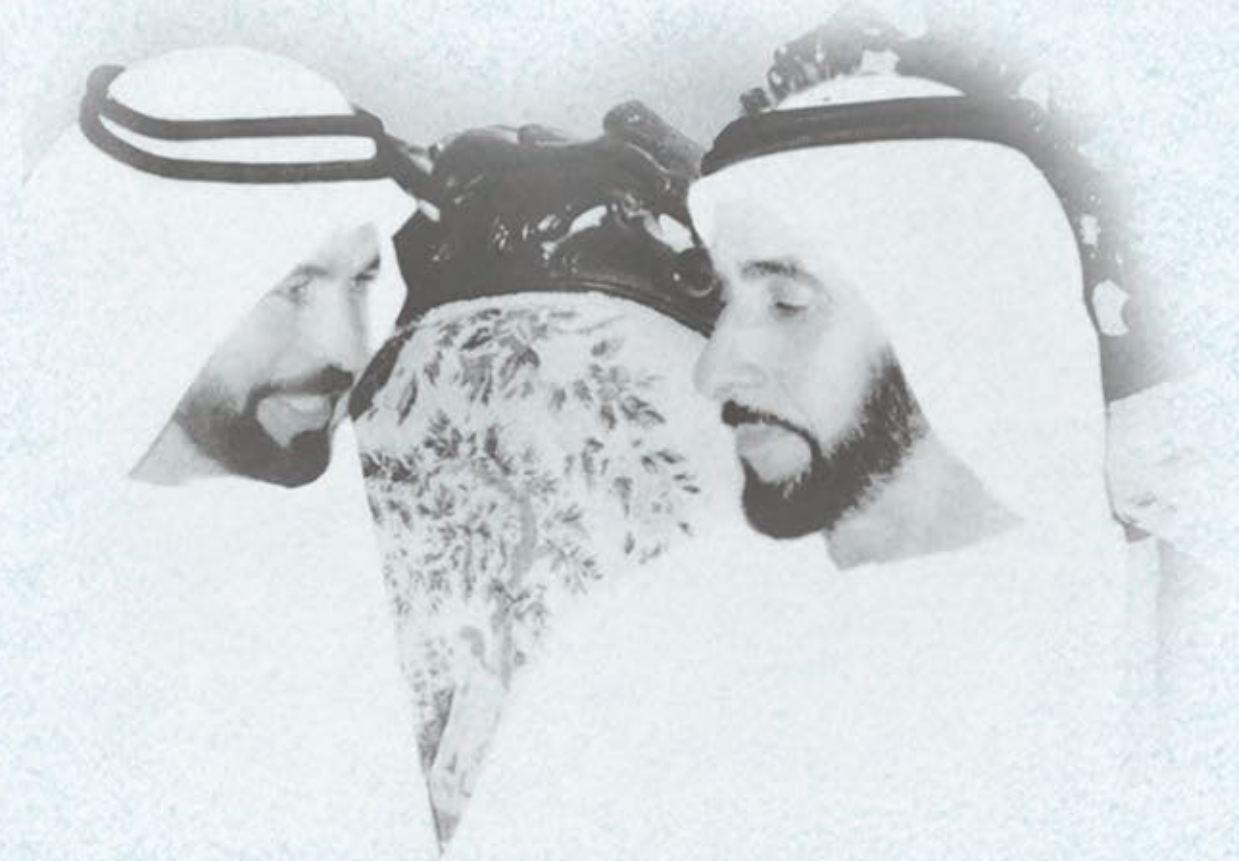
H.E RASHID BIN AWEIDHA WITH SHEIKH ZAYED BIN SULTAN AL NAHYAN