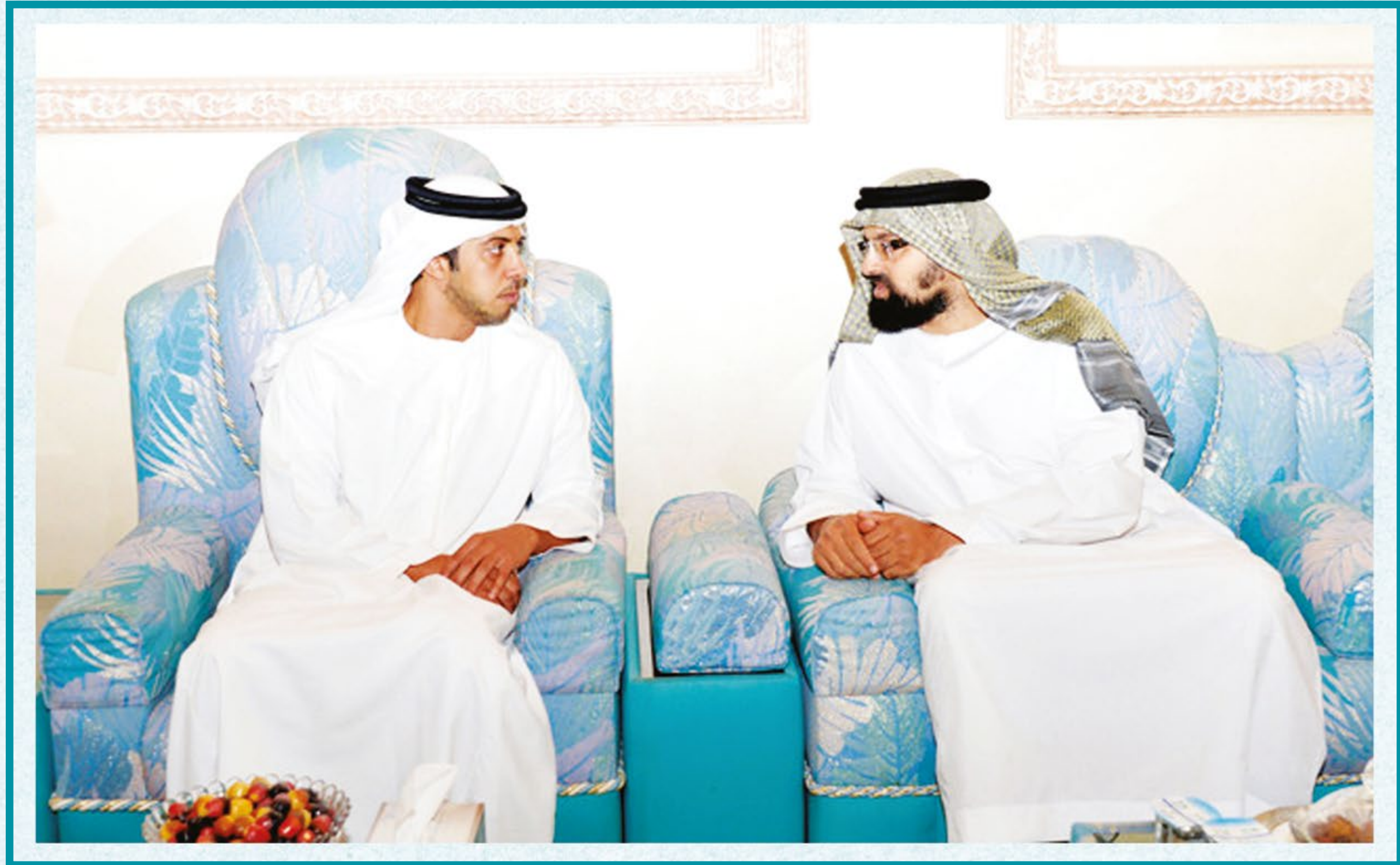
H.H MANSOUR BIN ZAYED AL NAHYAN