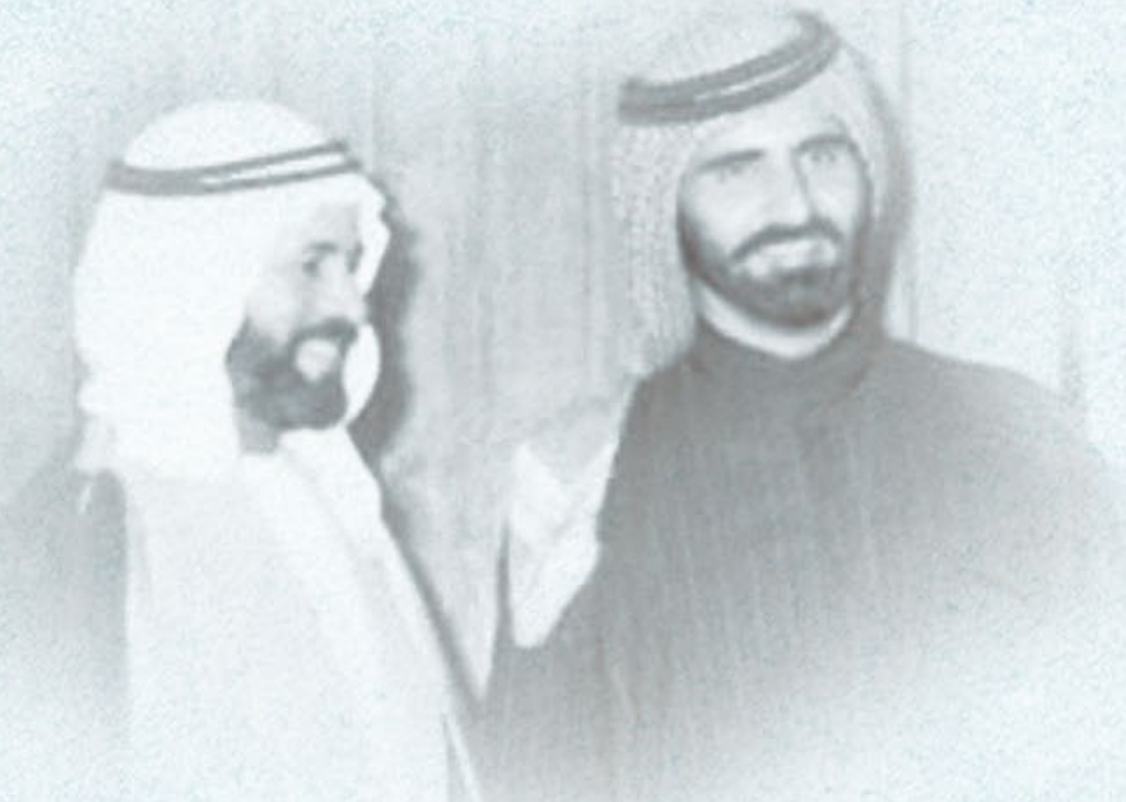
H.E RASHID BIN AWEIDHA WITH SHEIKH MOHAMMED BIN RASHID AL MAKTOUM